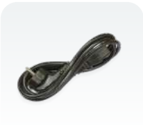
2 Power cords