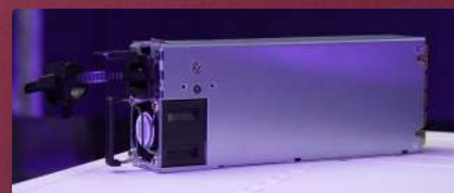
G1483-0600WNB, hot-swap 600 W power supply, available for purchase separately!

4K security cameras with built-in winter heating elements, LED ad screens, PoE-powered light fixtures – CRS320 can output up to 90W per port , enough even for the most demanding devices! It comes with a reliable 600 W power supply, but we've reserved an expansion slot for an additional PSU, in case you need to raise the power output to 1150 W.